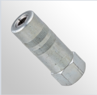
Testina Idraulica a 4 Griffe "Excellent" -Acciaio Zincato Bianco Fe/Zn 7 II Hydraulic Coupler with 4 Jaws "Excellent" -Steel White Zinc Plated Fe/Zn 7 II