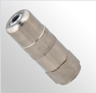
Testina Idraulica a 4 Griffe "Professional" -Acciaio Zincato Bianco Fe/Zn 7 II Hydraulic Coupler with 4 Jaws "Professional" -Steel White Zinc Plated Fe/Zn 7 II