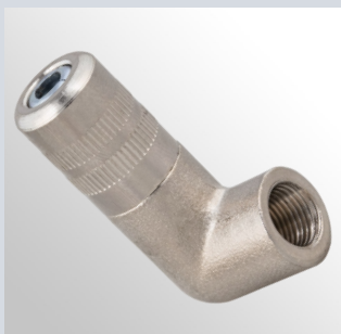
Testina Idraulica a 4 Griffe a 90° -Acciaio Zincato Bianco Fe/Zn 7 II Hydraulic Coupler with 4 Jaws 90° -Steel White Zinc Plated Fe/Zn 7 II